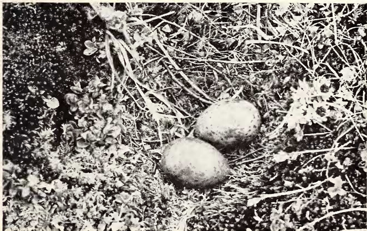
Fig. 6. Nests of a) Parasitic Jaeger, 27 June, b) Long-tailed Jaeger, 23 June 1960.

laris , a few blades of grass, and a few bits of dry, rotten, brown willow of the color of the eggs were the only nesting materials. The two olive-brown eggs spotted with brown and black measured 56 \times 44 mm and 67 \times 43 mm. While we were at the nest the birds feigned injury both on the ground and in flight, and continuously gave alarm notes like the mewling of a cat. This represents the first breeding record for the island.